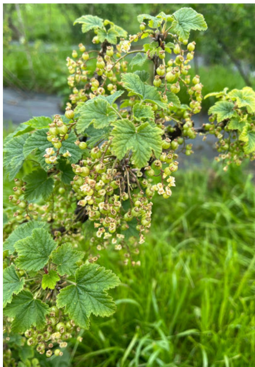
New currants on bush