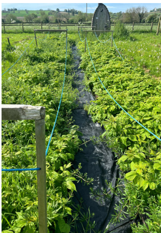
A new path between raspberry bushes