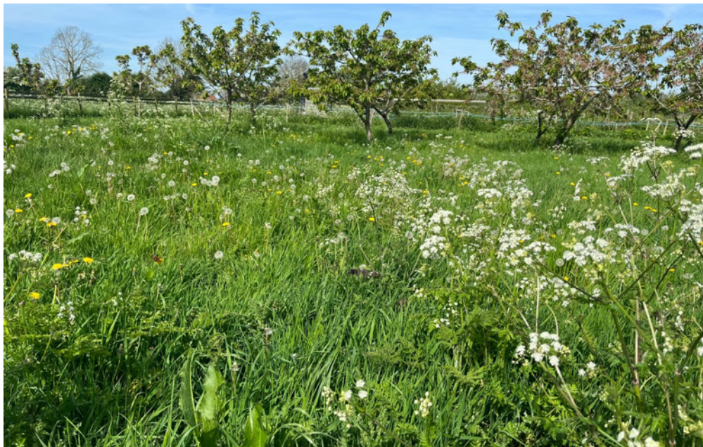
Wildflowers round the trees